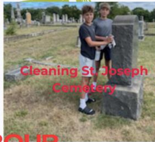
Cleaning St. Joseph Cemetery