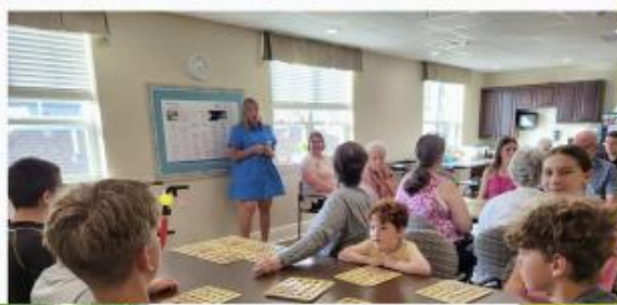
BINGO AT HARMONY