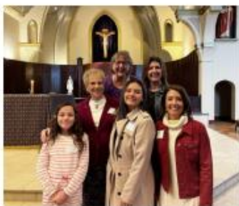
O CIA Rite of Election St. James the Greater, Charles Town March 24, 2024

There is a Hospitality Ministry volunteer here today to sell tickets for the "Evening of Gathering", formal dinner on April 12 th . Tickets are $40 per person for a hand-crafted surf and turf meal.