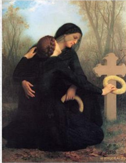
All Souls' Day by William-Adolphe Bouguereau