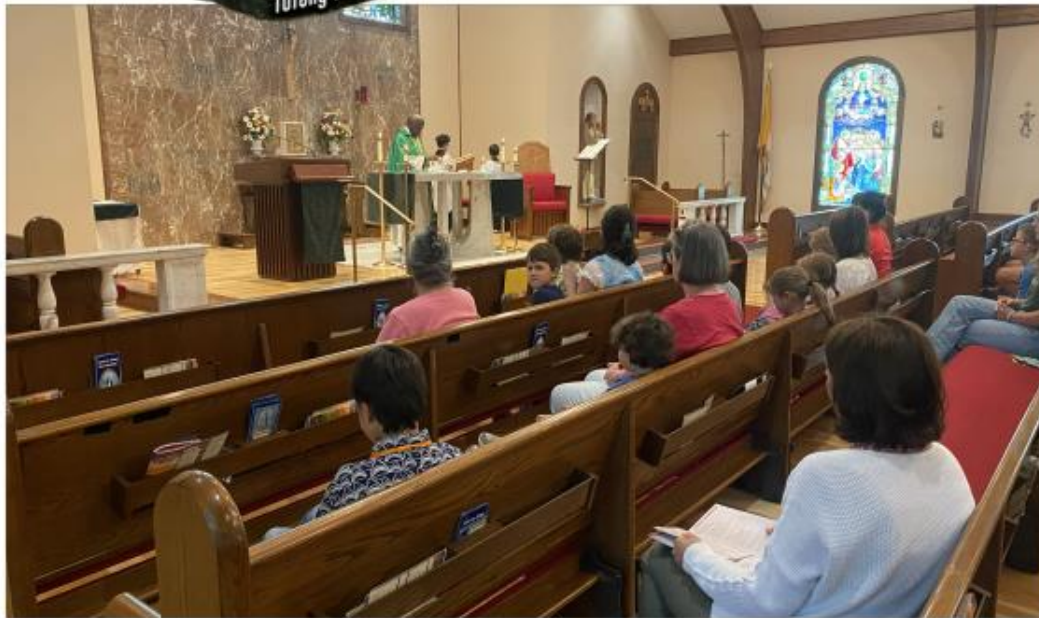
Wed. Evening Mass welcomed VBS