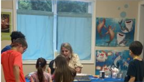
Reef Rec Outdoor Games