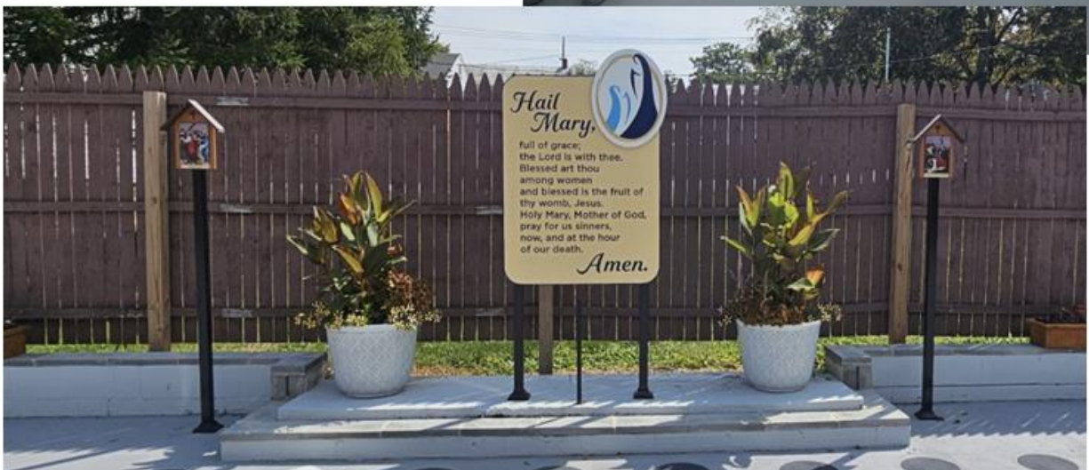
Hail Mary Prayer