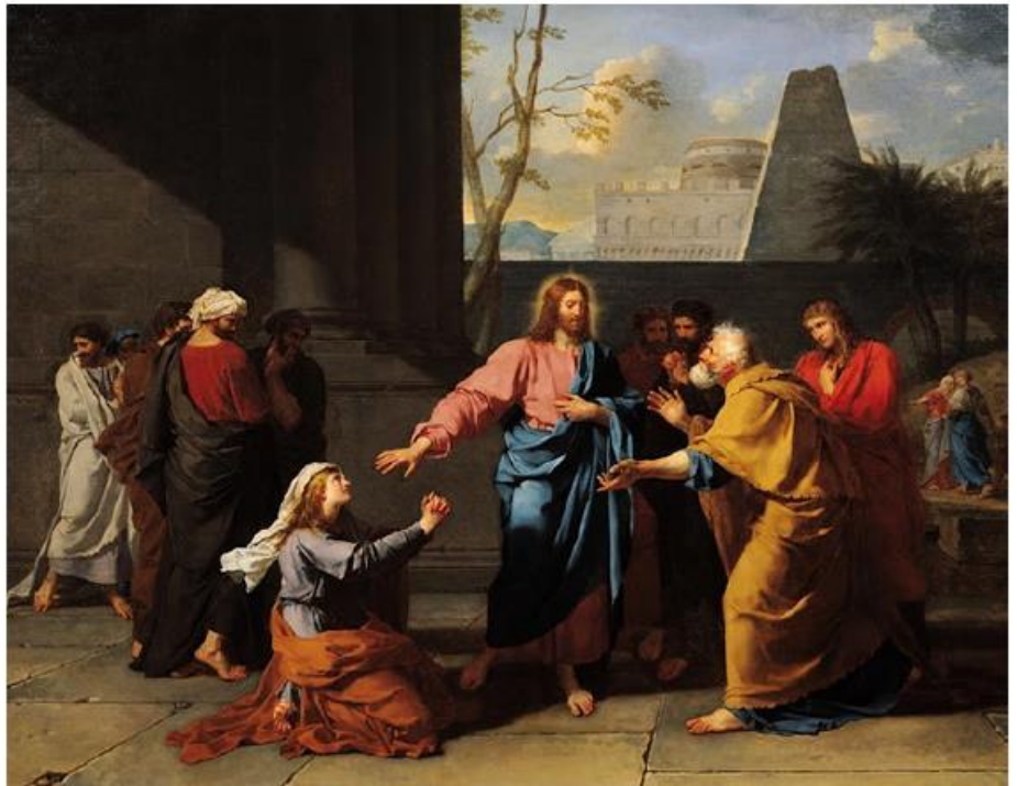
Christ and the Canaanite Woman