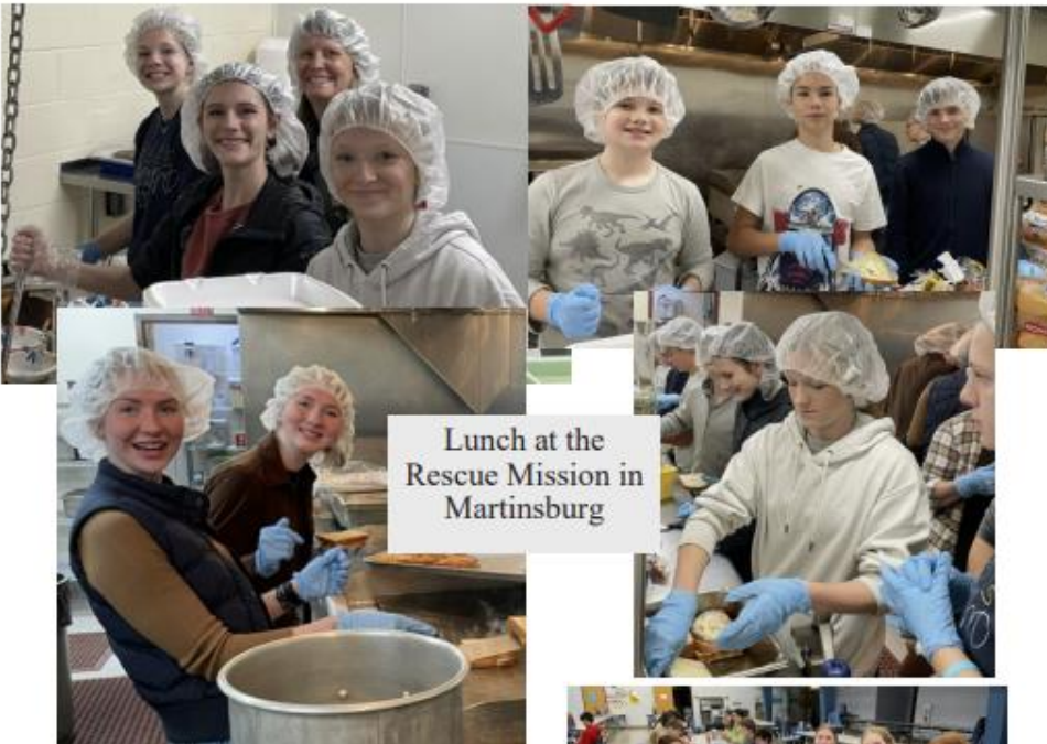
Lunch at the Rescue Mission in Martinsburg

Our Youth Group has been busy. Youth Group is open to all students from 6 th —12 th grade. Call the Parish Office to get involved.